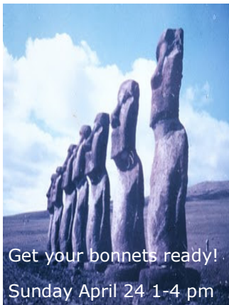
Get your bonnets ready! Sunday April 24 1-4 pm